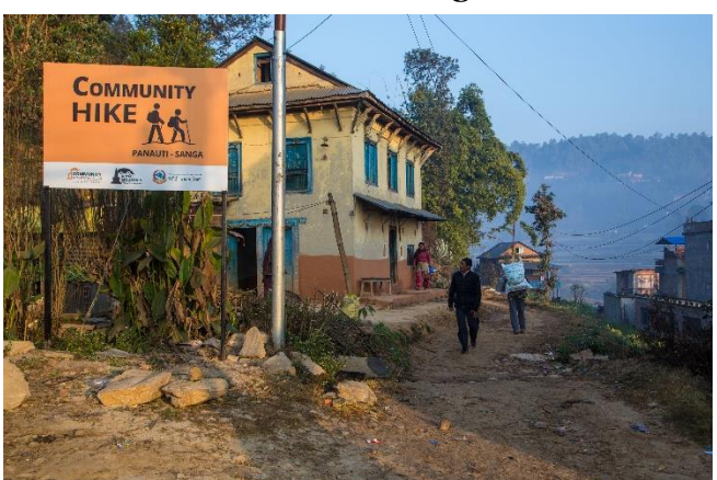
Starting point of Sanga-Panauti Community Hike

In terms of increasing standards of living and personal development, 92% of the respondents in Panauti said that their standards of living had increased and 83% of respondents shared that the