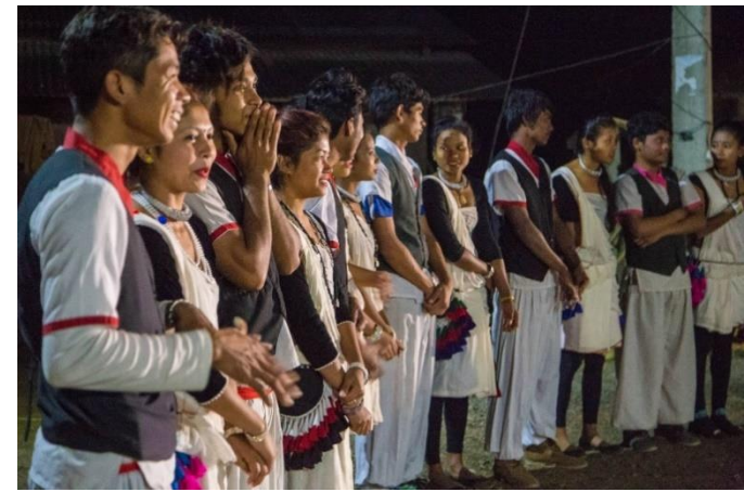
Tharu Cultural Dance Performance at Barauli Community Homestay

The Barauli Community Homestay is also engaged in wildlife preservation. Some of the activities like Jeep Safari or community forest walk are offered to travelers in Barauli. The local people have a strong sense of ownership